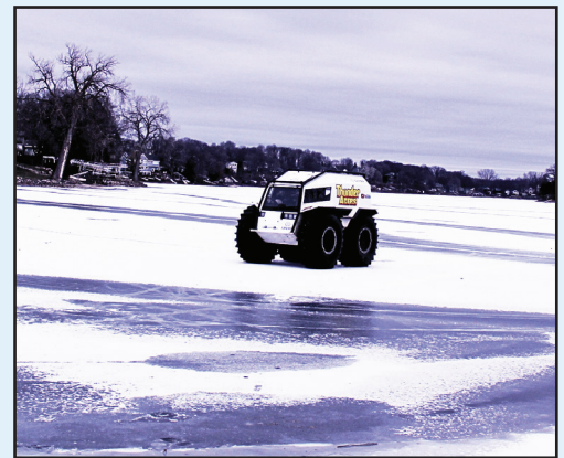
New Prague's Jim Bendzick loaded up several MVEC linemen in his SHERP and crossed over thin ice on Prior Lake in order to help the co-op restore power to members on Twin Isle, an island on Upper Prior.

conditions with ease. According to Bendzick, its massive tires distribute the weight evenly and allow the SHERP to drive lighter on the ice.